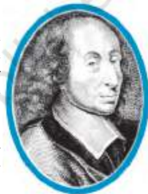
Blaise Pascal (1623-1662)

In earlier classes, we have learnt how to find the squares and cubes of binomials like a + b and a - b . Using them, we could evaluate the numerical values of numbers like (98)^2 = (100 - 2)^2 , (999)^3 = (1000 - 1)^3 , etc. However, for higher powers like (98)^5 , (101)^6 , etc., the calculations become difficult by using repeated multiplication. This difficulty was overcome by a theorem known as binomial theorem. It gives an easier way to expand (a + b)^n , where n is an integer or a rational number. In this Chapter, we study binomial theorem for positive integral indices only.