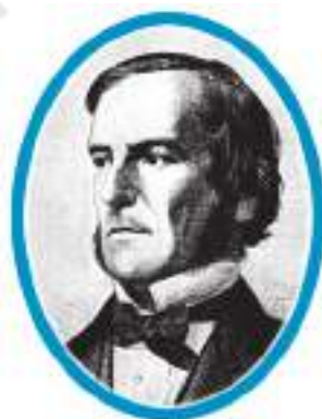
George Boole (1815 - 1864)

In mathematical language, there are two kinds of reasoning – inductive and deductive. We have already discussed the inductive reasoning in the context of mathematical induction. In this Chapter, we shall discuss some fundamentals of deductive reasoning.