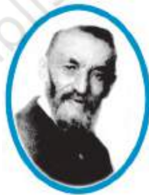
G. Peano (1858-1932)

In contrast to deduction, inductive reasoning depends on working with each case, and developing a conjecture by observing incidences till we have observed each and every case. It is frequently used in mathematics and is a key aspect of scientific reasoning, where collecting and analysing data is the norm. Thus, in simple language, we can say the word induction means the generalisation from particular cases or facts.