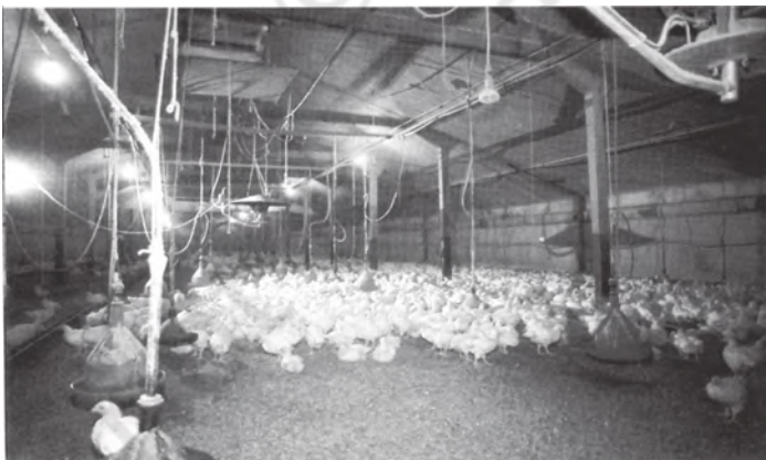
Fig. 6.4 Poultry has the largest share of total livestock in India

However problems related to over- fishing and