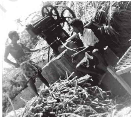
Fig. 6.2 Jaggery making is an allied activity of the farming sector

As agriculture is already overcrowded, a major proportion of the increasing labour force needs to find alternate employment opportunities in other non-farm sectors. Non-farm economy has several segments in it;