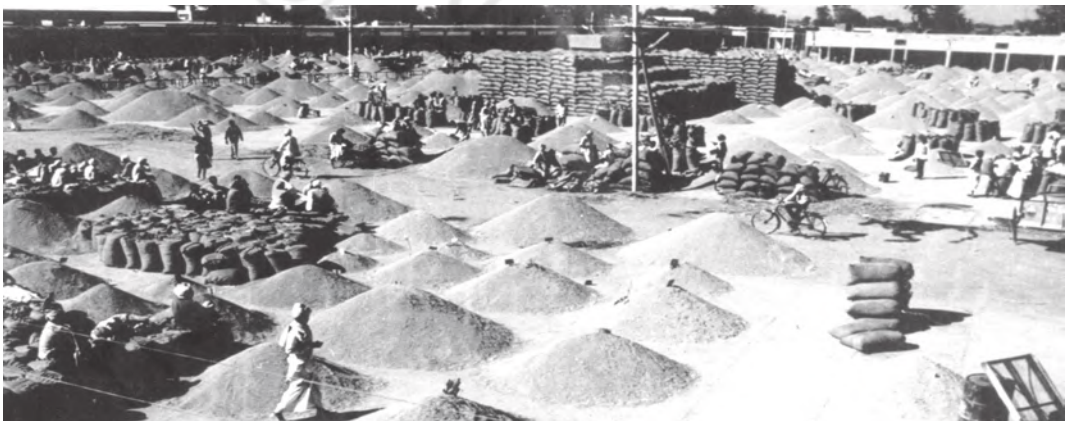
Fig. 6.1 Regulated market yards benefit farmers as well as consumers

Let us discuss four such measures that were initiated to improve the marketing aspect. The first step was regulation of markets to create orderly and transparent marketing conditions. By and large, this policy benefited farmers as well as consumers. However, there is still a need to develop about 27,000 rural periodic markets as regulated market places to realise the full potential of rural markets. Second component is provision of physical infrastructure facilities like roads, railways, warehouses, godowns, cold storages and processing units. The current infrastructure facilities are quite inadequate to meet the growing demand and need to be improved. Cooperative