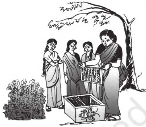
Fig. 6.5 Women in rural households take up bee-keeping as an entrepreneurial activity

Horticulture: Blessed with a varying climate and soil conditions, India has adopted growing of diverse horticultural crops such as fruits, vegetables, tuber crops, flowers, medicinal and aromatic plants, spices and plantation crops. These crops play a vital role in providing food and nutrition, besides addressing employment concerns. Horticulture sector contributes nearly one-third of the value of agriculture output and six per cent of Gross Domestic Product of India. India has emerged as a world leader in producing a variety of fruits like mangoes, bananas, coconuts, cashew nuts and a number of spices and is the second largest producer of fruits and vegetables. Economic condition of many farmers engaged in horticulture has improved and it has become a means of improving livelihood for many unprivileged classes. Flower