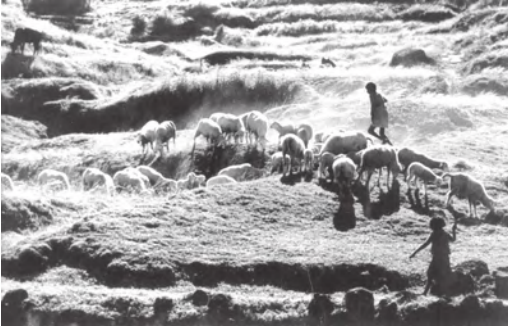
Fig. 6.3 Sheep rearing — an important income augmenting activity in rural areas

followed by others. Other animals which include camels, asses, horses, ponies and mules are in the lowest rung. India had about 300 million cattle, including 108 million buffaloes in 2012. Performance of the Indian dairy sector over the last three decades has been quite impressive. Milk production in the country has increased by about ten times between 1951-2016. This can be attributed mainly to the successful implementation of 'Operation Flood'. It is a system whereby all the farmers can pool their milk produced according to different grading (based on quality) and the same is processed and marketed to urban centres through cooperatives. In this system the farmers are assured of a fair price and income from the supply of milk to urban markets. As pointed out earlier Gujarat state is held as a success story in the efficient implementation of milk cooperatives which has been emulated by many states. Gujarat, Madhya Pradesh, Uttar Pradesh, Andhra Pradesh, Maharashtra, Punjab and Rajasthan, are major milk producing states. Meat,