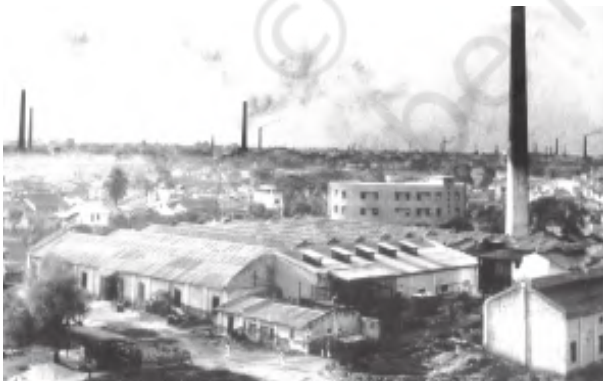
Fig. 9.2 Damodar Valley is one of India's most industrialised regions. Pollutants from the heavy industries along the banks of the Damodar river are converting it into an ecological disaster

But with population explosion and with the advent of industrial revolution to meet the growing needs of the expanding population, things changed. The result was that the demand for resources for both production and consumption went beyond the rate of regeneration of the resources; the pressure on the absorptive capacity of the environment increased tremendously — this trend continues even today. Thus what has happened is a reversal of supply-demand relationship for environmental quality — we are now faced with increased demand for environmental resources and services but their supply is limited due to overuse