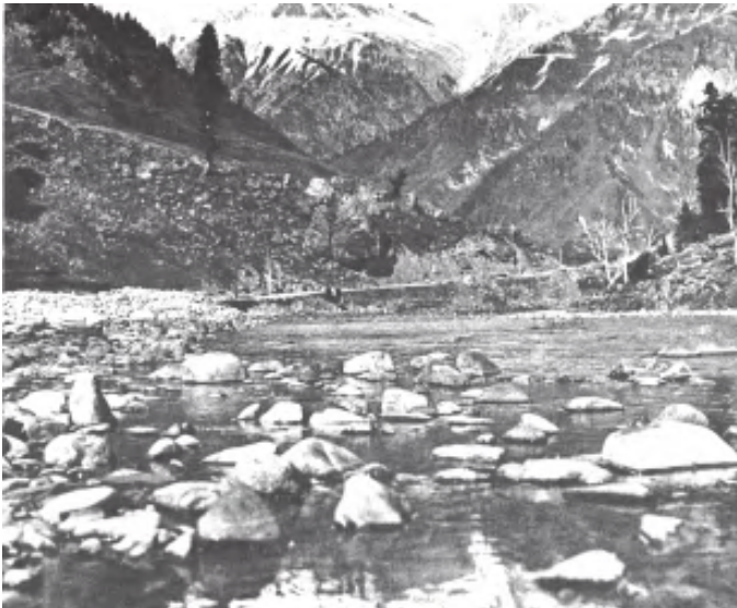
Fig. 9.1 Water bodies: small, snow-fed Himalayan streams are the few fresh-water sources that remain unpolluted.

this results in an environmental crisis. This is the situation today all over the world. The rising population of the developing countries and the affluent consumption and production standards of the developed world have placed a huge stress on the environment in terms of its first two functions. Many resources have become extinct and the wastes generated are beyond the absorptive capacity of the environment. Absorptive capacity means the ability of the environment to