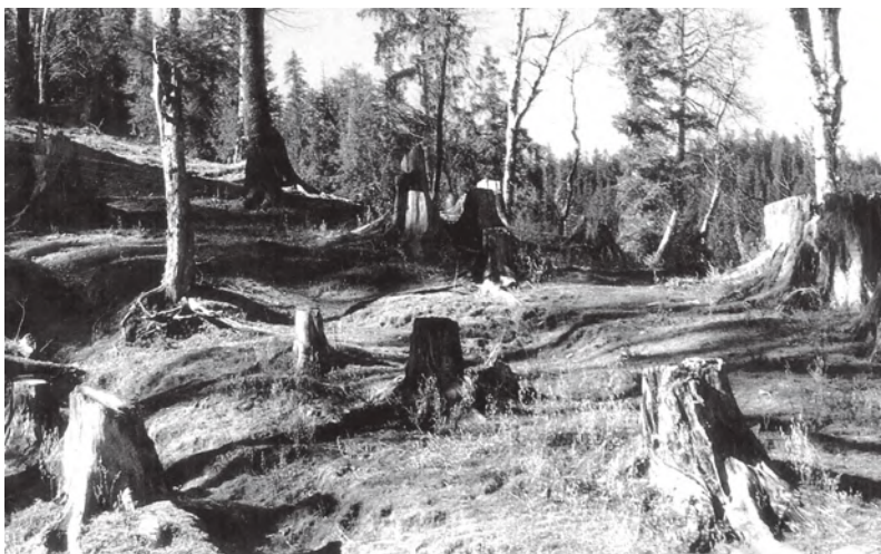
Fig. 9.3 Deforestation leads to land degradation, biodiversity loss and air pollution

India has abundant natural resources in terms of rich quality of soil, hundreds of rivers and tributaries, lush green forests, plenty of mineral deposits beneath the land surface, vast stretch of the Indian Ocean, ranges of mountains, etc. The black soil of the Deccan Plateau is particularly suitable for cultivation of cotton, leading to concentration of textile industries in this region. The Indo-Gangetic plains — spread from the Arabian Sea to the Bay of Bengal — are one of the most fertile, intensively cultivated and densely populated regions in the world. India's forests, though unevenly distributed, provide green cover for a majority of its population and natural cover for its wildlife. Large deposits of iron-ore, coal and natural gas are found in the country. India accounts for nearly 8 per cent of the world's total iron-ore reserves. Bauxite, copper, chromate, diamonds, gold, lead, lignite, manganese, zinc, uranium, etc. are also available in different parts of the country. However, the developmental activities in India have resulted in