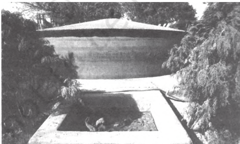
Fig.9.4 Gobar Gas Plant uses cattle dung to produce energy

Wind Power: In areas where speed of wind is usually high, wind mills can provide electricity without any adverse impact on the environment. Wind turbines move with the wind and electricity is generated. No doubt, the initial cost is high. But the benefits are such that the high cost gets easily absorbed.